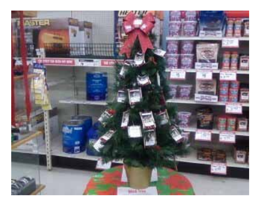
WISH TREE: Our wish tree yielded many generous and useful donations.

Wish Tree at Tractor Supply: Tractor Supply in Alden was kind enough to allow the GALs to display a Christmas Wish Tree. The ornaments contained photographs of the foster dogs and contained special requests of various items for each one. We were pleasantly surprised at the outpouring of items purchased and donated by the loyal patrons of Tractor Supply. We received a variety of items including: dog food, biscuits, treats, various toys and dishes. Thank you to Tractor Supply, and its employees for supporting and promoting this effort. And thank you to all that purchased items and donated them.