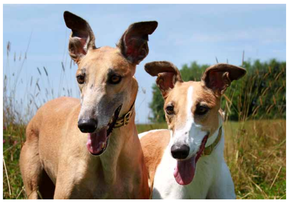
SIBLINGS: Luke and Silky were just two of the dogs that made their way to Buffalo in 2010.

By most accounts, pet adoption has decreased nationally during the last couple of years. This