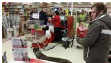
Booth at Tractor Supply.