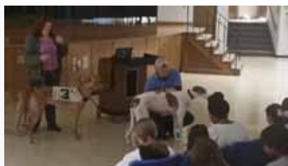
Speaking engagement at Amherst Elementary School.