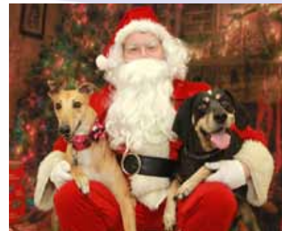
Pet photos with Santa.