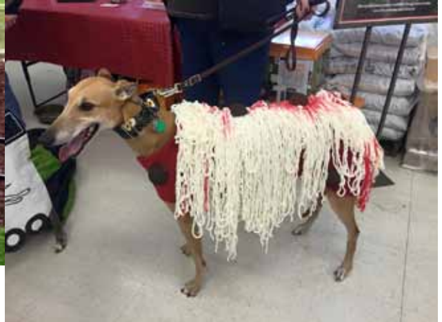
This is not Spur, but a very clever im-pasta.