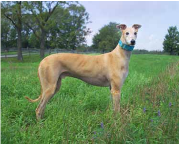
Devlin: my special boy that taught me patience.