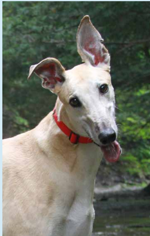
Number 100: Ruffian seems to enjoy his adoptive home.

As I said, difficult to sum up, but in any venture I suppose it's good to take inventory sometimes. To me, what is most important is that we have always been a force for good for the welfare of greyhounds in general, in our organization and elsewhere. Our beginnings as a support organization continue to serve us well, as our ripples of influence reach well beyond our geographical boundaries. A large number of greyhounds have found homes through other organizations because of the work of our volunteers in transporting, fundraising or networking, and we can be proud that our contributions have meant so much to so many.