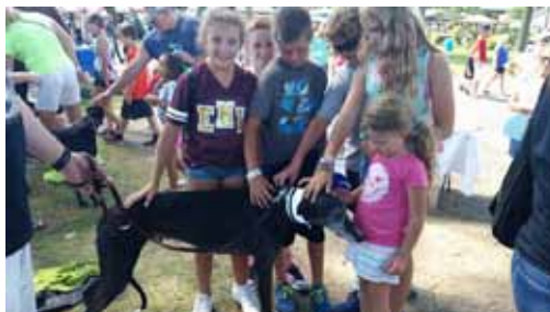
The Erie County Fair!