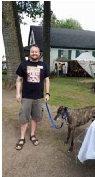
“Greetings, and welcome to the Erie County Fair. Smiles, everyone, smiles.”

She likes grey butts and she cannot lie.