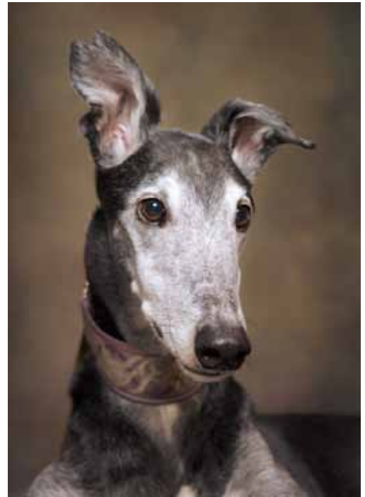
Winner: such a strong and gentle boy with an old soul.

The vow I made to Action was to wake up each day and do all that I can for greyhounds. With your help, I have been able to keep that promise. Thank you.