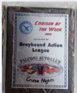
Car show in Depew.