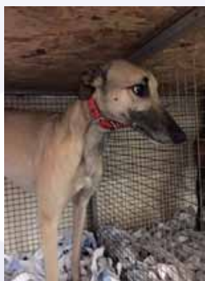
Mac's Allure (Allure) arrives.