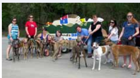
Our float and marchers at the Tulip Festival parade.