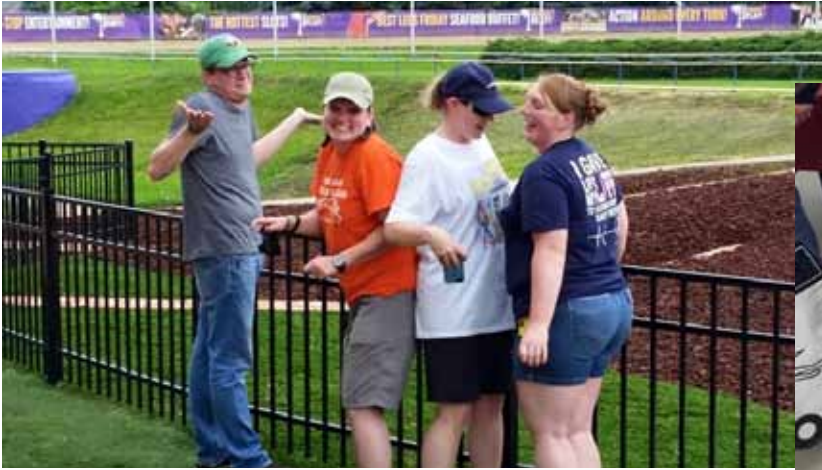
The Lambada has been called “the forbidden dance”. Now we know why.