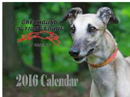
GALs release our annual calendar.