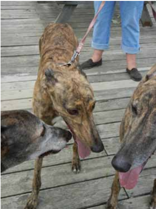
“Psst...is she wearing long shorts or short pants?”

She likes grey butts and she cannot lie.