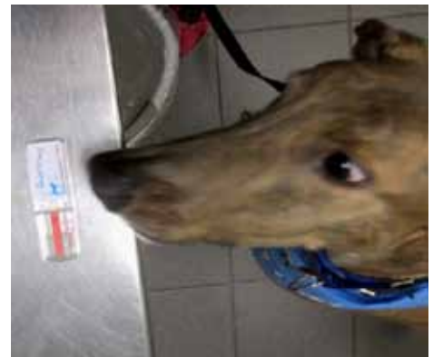
Waiting to see what my blood type is...