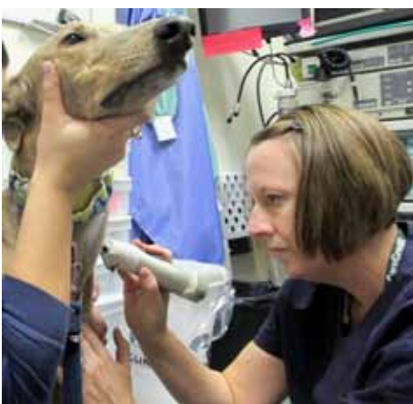
Just a little off the top, please!

All in all, the entire procedure was painless, quick and full of love. There is a period of 10 weeks between donations, and generally a donation can be made 3-4 times a year. I hope I can donate again soon. A few minutes of my life can give life back to a canine that needs more than 5 minutes. Every donation can help save a life.