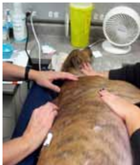
Getting some subcutaneous fluids post donation