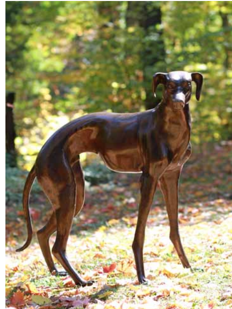
THE BIG PRIZE: A life size bronze greyhound statue donated by the Fink family.

Thank you to our contributors and bidders for making the Auction a Success.