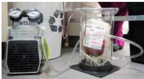
Vacuum on the left, blood collection bag on the right