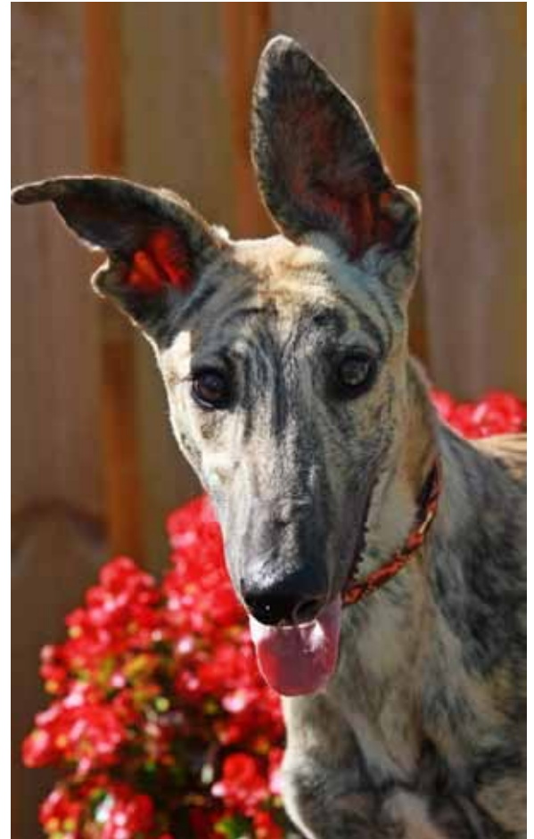
TOMMY CAN YOU HEAR ME: Tommy was a big part of 2012.

So, as happy as I am to draw a line under last year and start anew, it is not hard to identify all the good things that came from it. Perhaps it is because of our roots as a support organization that we are so effective when faced with adversity. Did we have a tough year? Yes. Did we endure terrible losses? Yes. Will we try to find homes for greyhounds tomorrow and each day after that? Absolutely. We have many things planned for 2013, and I hope you will continue to be a part of them.